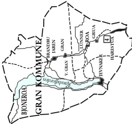
A map of Hadeland, Oppland fylke (county), Norway, showing the three kommuner (municipalities): Gran, Jevnaker, and Lunner

Eager to meet with their fellow Hadelendings in America, the immigrants and their descendants organized the Hadeland Lag in 1910. According to its constitution, the lag is designed to help maintain contacts among Hadeland descendants; maintain a bond between Hadelendings in Norway and in