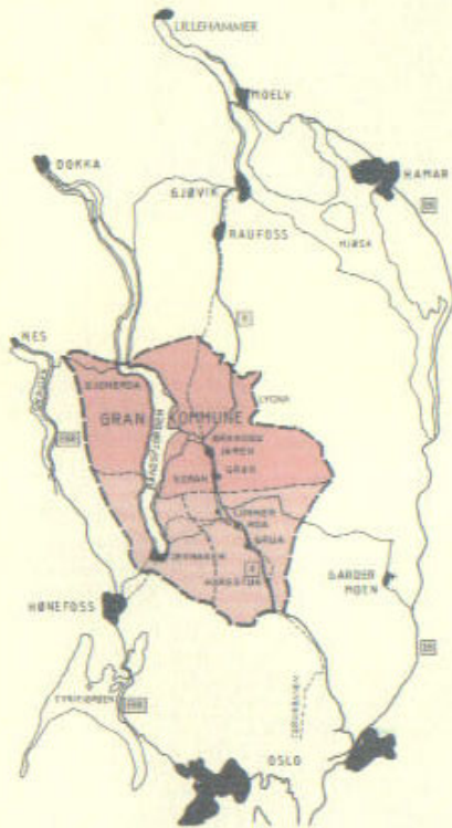
Hadeland with surroundings.

Hadeland was the land of the Hades – the warriors. Incidentally, one of the attractions of Hadeland Folk Museum is the grave-mound of Halvdan the Black.