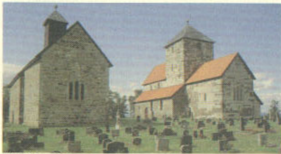
The Sister Churches.

Via Ferieverden Storgt. 32, 2750 Gran Phone: (+047) 61 33 88 00 Fax: (+047) 61 33 88 09